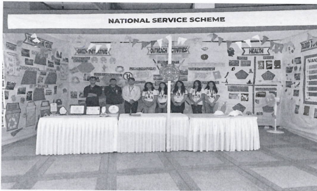
NSS exhibition during NAAC