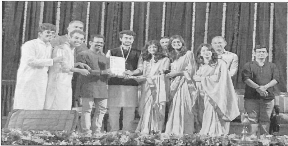
2 nd in Indian Group Song in 57 th Youth Festival