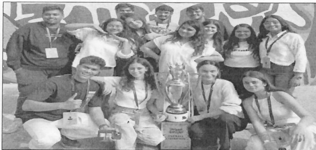
5th Consecutive Overall Champions of Mood Indigo