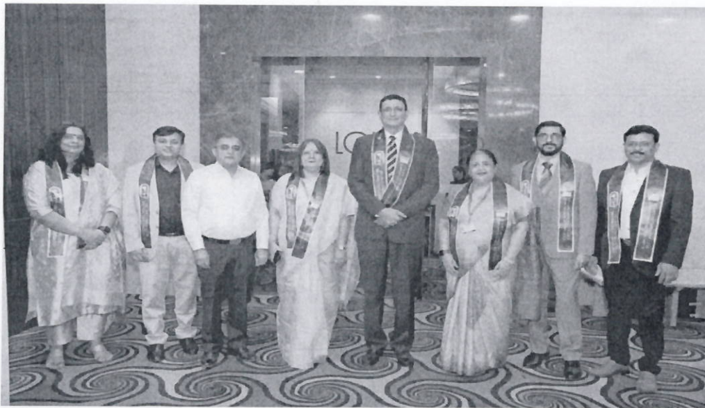
Degree Certificate Distribution Ceremony