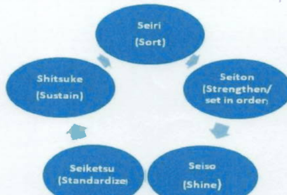
Figure 1: Pillars of Kaizen 5S